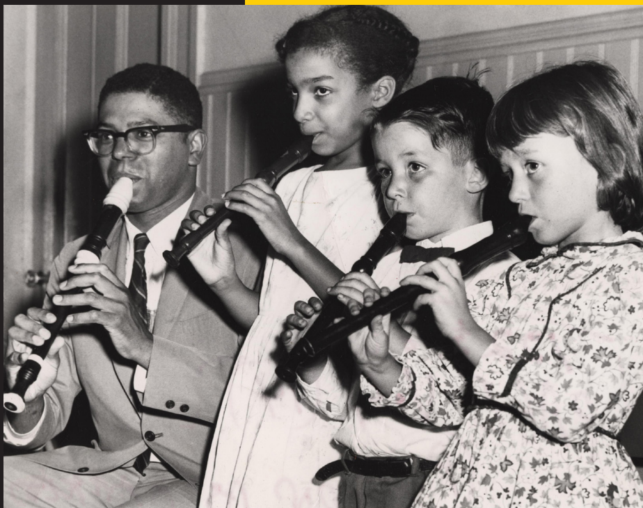
1964 - Recorder Class